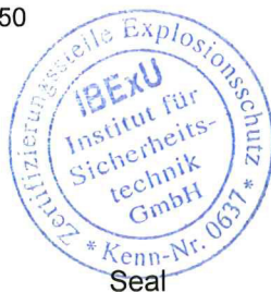
(ID no. 0637)