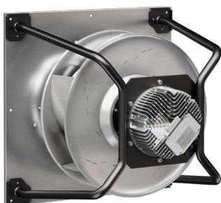
EC centrifugal fans – RadiPac support bracket Sizes 250 – 800