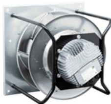
EC centrifugal fans – RadiPac support bracket Fan sizes 355 - 400